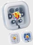
Color Pop Ear Buds $7.99