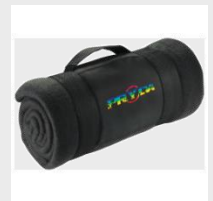
Fleece Blanket $19.99