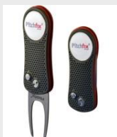
Hybrid Divot Tool $15.99