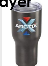
Arctix Vacuum Tumbler $20.99