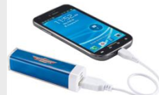
Amp Power Bank $9.99