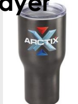
Arctix Vacuum Tumbler $20.99