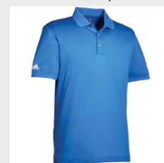
Adidas Performance Polo $49.99

it can be branded, we can get it for you, with competitive prices and outstanding service!