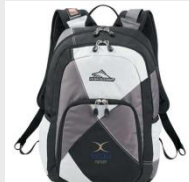
High Sierra Backpack $49.99