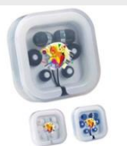
Color Pop Ear Buds $7.99