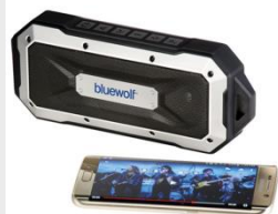
Waterproof Outdoor Bluetooth Speaker $46.99