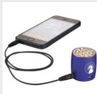
Havoc Speaker $15.99