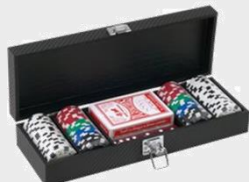
Poker Set $47.99