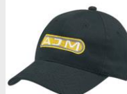
Brush Cotton Hat $9.99