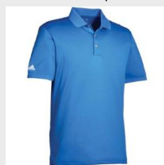
Adidas Performance Polo $49.99

it can be branded, we can get it for you, with competitive prices and outstanding service!