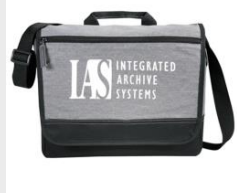
Messenger Bag $14.99