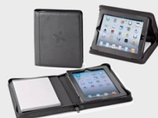
Tablet Organizer $22.99