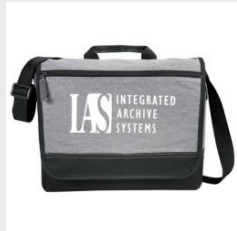
Messenger Bag $14.99