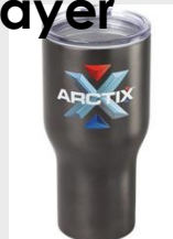
Arctix Vacuum Tumbler $20.99