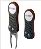
Hybrid Divot Tool $15.99