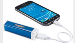
Amp Power Bank $9.99