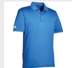
Adidas Performance Polo $49.99

it can be branded, we can get it for you, with competitive prices and outstanding service!