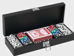
Poker Set $47.99