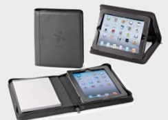
Tablet Organizer $22.99