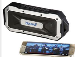
Waterproof Outdoor Bluetooth Speaker $46.99