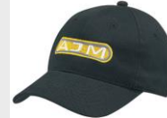
Brush Cotton Hat $9.99