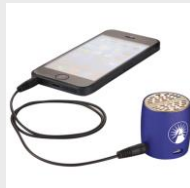
Havoc Speaker $15.99