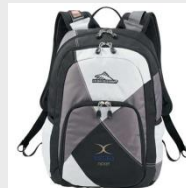
High Sierra Backpack $49.99