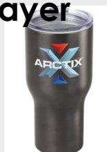
Arctix Vacuum Tumbler $20.99