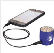
Havoc Speaker $15.99