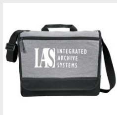
Messenger Bag $14.99