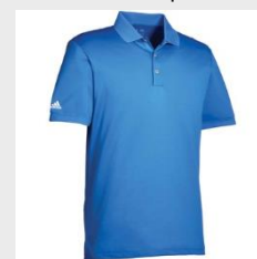
Adidas Performance Polo $49.99

it can be branded, we can get it for you, with competitive prices and outstanding service!