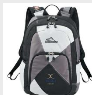
High Sierra Backpack $49.99