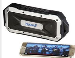
Waterproof Outdoor Bluetooth Speaker $46.99