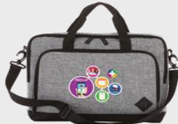
15" Computer Briefcase $17.99