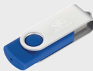
Rotate Flash Drive 4GB $9.99