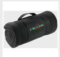
Fleece Blanket $19.99