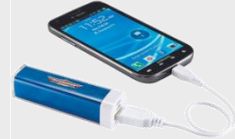
Amp Power Bank $9.99