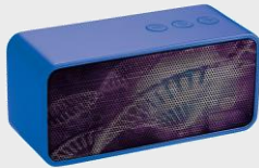
Stark Bluetooth Speaker $13.99