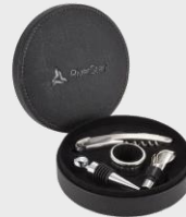
Wine Gift Set $19.99