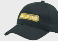
Brush Cotton Hat $9.99