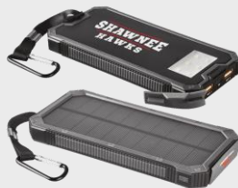
Solar Power Bank $49.99