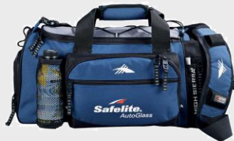
High Sierra Duffel Bag $49.99