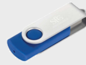
Rotate Flash Drive 4GB $9.99