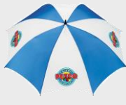
62" Tour Golf Umbrella $18.99