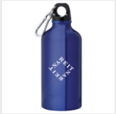
17oz Aluminum Sports Bottle $4.99