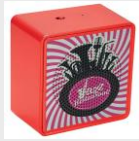
Whammo Bluetooth Speaker $8.99