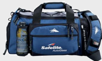
High Sierra Duffel Bag $49.99