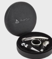
Wine Gift Set $19.99