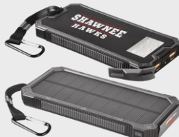
Solar Power Bank $49.99