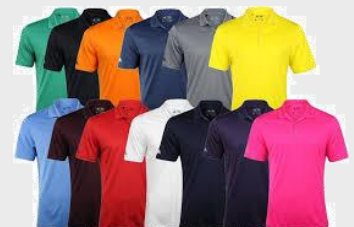
Adidas Performance Polo $49.99

If it can be branded, we can get it for you, with competitive prices and outstanding service!