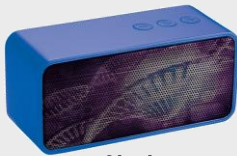
Stark Bluetooth Speaker $13.99