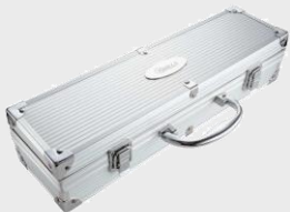
Grill Master 3pc BBQ Set $39.99