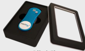
PitchFix Divot Tool Gift Box $19.79