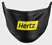
4 Ply Silk Screened Cotton Face Mask $4.19